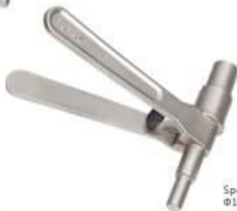
Specifications: Φ16,20,25,32mm B