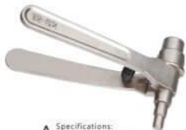
A Specifications: Φ12,16,20,25,32mm