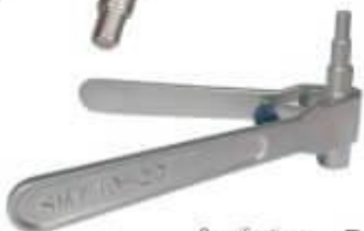
Specifications: Φ10 12 16 20mm B