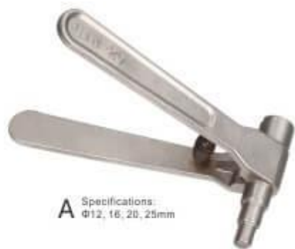
A Specifications: Φ12, 16, 20, 25mm