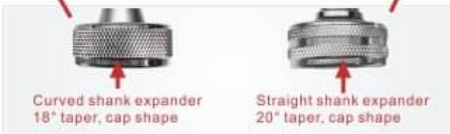
Curved shank expander 18° taper, cap shape

The heads of two kinds of expander are not universal