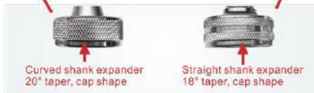
Curved shank expander 20° taper, cap shape

二种形状扩管器的扩管头不可通用 The heads of two kinds of expander are not universal