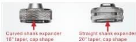
Curved shank expander 16° taper, cap shape